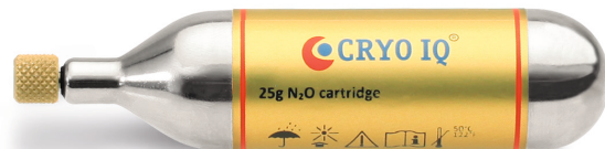
Cartridge 25 g (Item no. 173445)