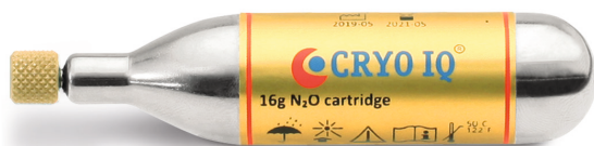
Cartridge 16 g (Item no. 173444)

Cartridge designed to work with CryolQ® DERM plus and CryolQ® PRO.